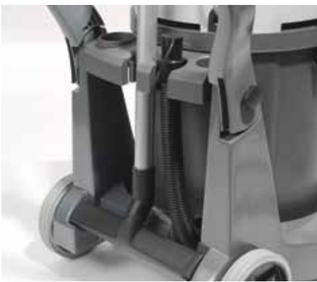
Compact and well designed parking position for handle and tools makes storage and transport easy