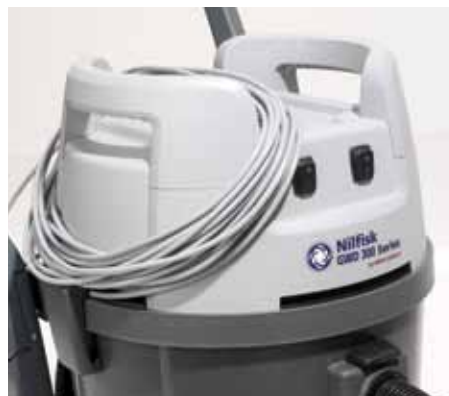
Two large lifting handles give a good grip for easy removal of the motor top. They also serve as a convenient way to store the cable