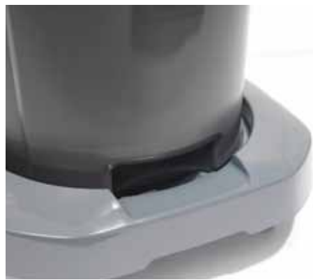
An ergonomic grip is builtin to facilitate the tip & pour tank emptying system (50 & 75 litre-versions)