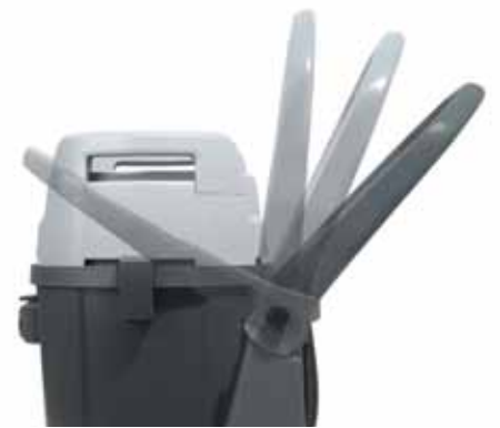
The handle is adjustable to suit the operator and tilts tank for compact storage