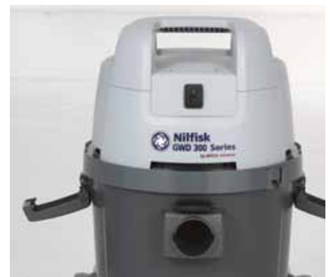
Large latches for ergonomic use and easy access. On the larger models (50 & 70 litre versions) the latch is designed to be in two positions, which makes it easy to put the motor top on/off