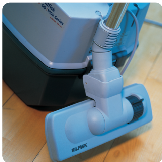
The handy parking solution allows vertical storage of tube and hose