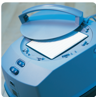
HEPA filter – 99.997% particle retention down to 0.3 microns