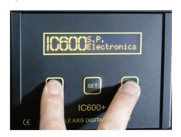
The "ADVANCED CONFIGURATION" is be accessed by pressing and holding the "UNIT" and "MODE" buttons from the Firmware screen