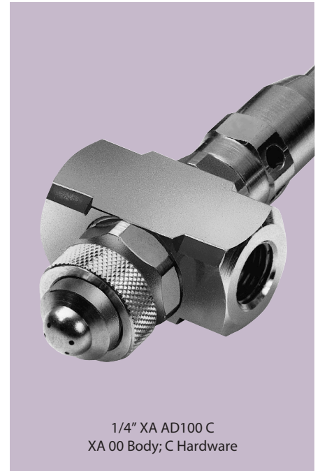
1/4" XA AD100 C XA 00 Body; C Hardware

Dimensions are approximate. Check with BETE for critical dimension applications.