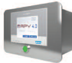
MAPY 4.0 as 19" input module