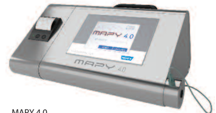
MAPY 4.0 with integrated printer