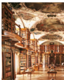
Museums, art galleries

The HygroPalm2-series (with integrated or interchangeable probes) is ideal for all applications where exact measurement of humidity and temperature is of decisive importance, e.g. the food and pharmaceutical industries, printing and paper industries, many trades, the sciences, meteorology, agricultural sector, climatology, etc. There is hardly a field today in which these parameters may be ignored. It is ultimately the measuring task at hand that defines the HygroPalm instrument that best meets your needs.