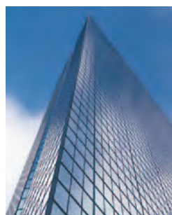
HVAC / Building management