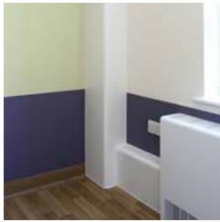
pipe boxing 5-7