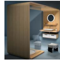
furniture & display 18-19