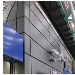
interior wall linings 14-15