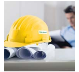
supply & install 20