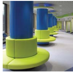
column casing 8-13