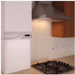
boiler pipe casing 4