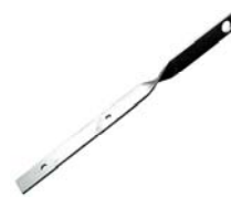
Straight Twist Bracket

o/a Height: 220mm o/a Length: 180mm Fixing Holes: 2 x 10mm