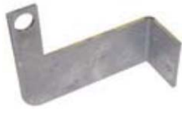
Extended Universal Bracket

o/a Height: 130mm o/a Length: 180mm Fixing Holes: 2 x 10mm