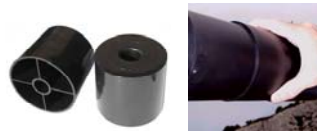
Roller Barrier Cups are available in Black and Green from stock (other colours available to special order)

All Brackets are manufactured from 6mm steel, with a galvanised finish (durable paint finish also available)