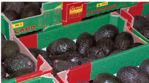
Storage conditions are critical

Minor, Weir & Willis Ltd, National Distribution Centre 241 Wellington Road Ind. Estate, Perry Barr, Birmingham B20 2QQ. Tel: 0121 344 4554. www.mww.co.uk