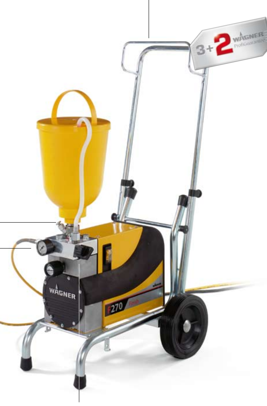
The pressure can be smoothly regulated

Practical when working direct from the packaging or the top reservoir.