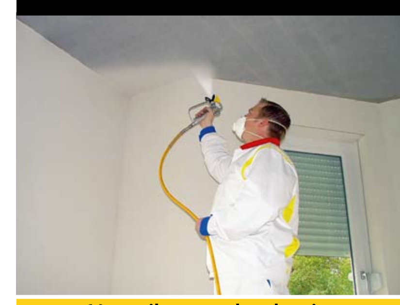
Versatile entry level units for painting and emulsion work