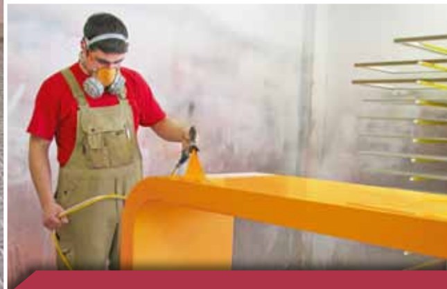
Pneumatic double diaphragm pump