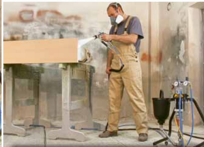
AirCoat paint spraying unit

Compact painting unit for top quality surfaces