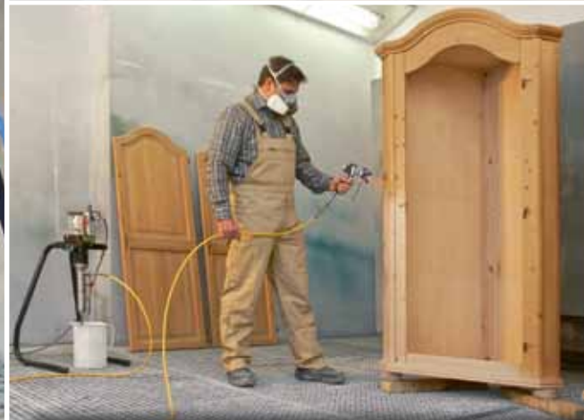
Airless paint spraying unit

Perfect results due to brilliant atomisation