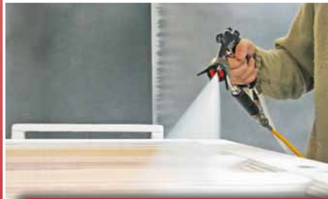
Pneumatic piston pump