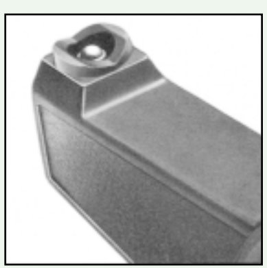
Carbide measuring probe for long life.

For: Hot dip galvanizing, hard chrome metalizing, paint, enamel, plastic coatings on steel