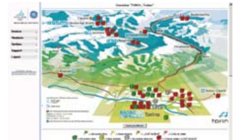
Graphical status overview