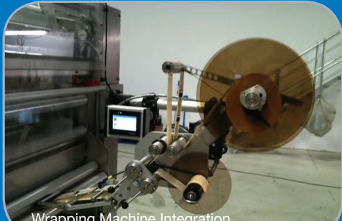
Wrapping Machine Integration