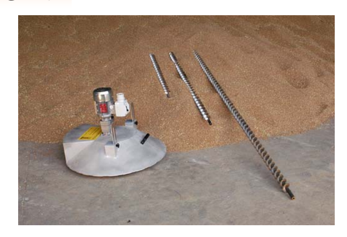
Rotary Control System