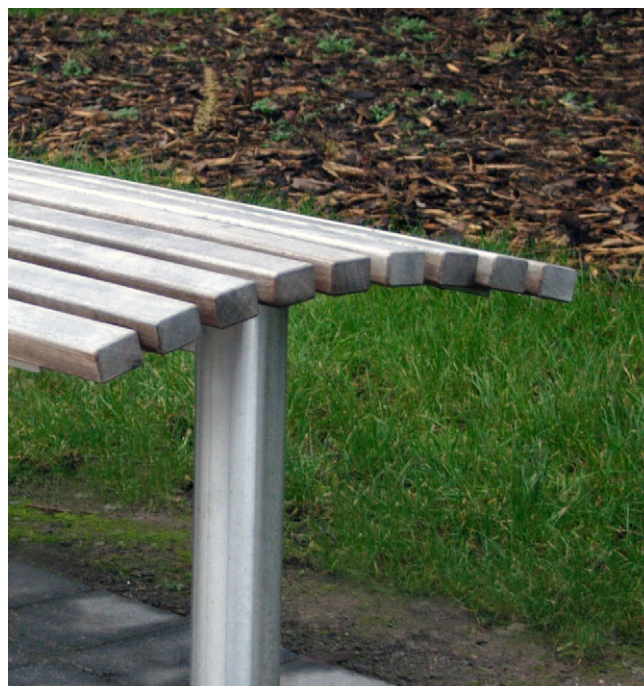
Above right, s19ss bench detail with oiled finish to wood.

If the timber is left untreated, over time it will gradually change to a silvery grey colour. The timber will remain structurally sound without further maintenance.