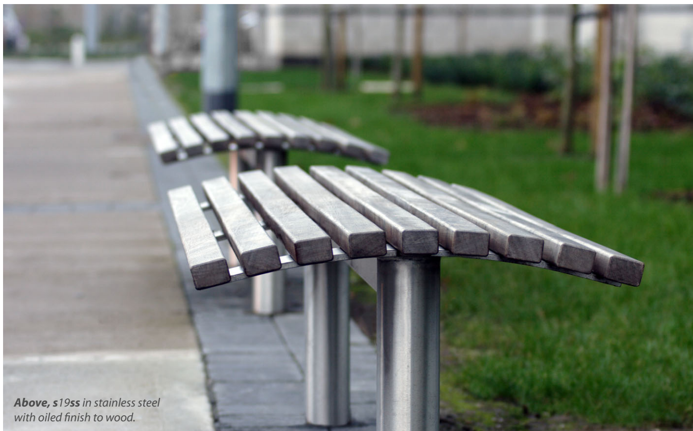
Above, s19ss in stainless steel with oiled finish to wood.