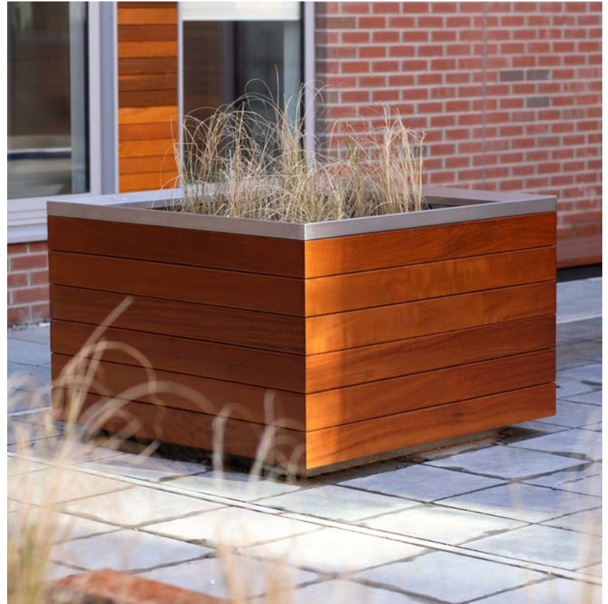
Above and right, s39 tree planter with micro porous stain to wood.