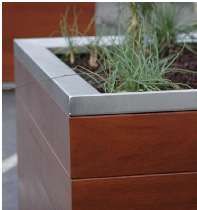
Right, s39 tree planter detail.

Inside the timber cladding is a galvanized steel structure. This is visible at the base of the box. The galvanized coating provides long term corrosion prevention. When corrosion treatment is required remove any surface rust and apply 'cold galvanizing' paint to damaged area. For more information on remedial work contact Omos.