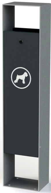
Above and right, s53 dog litter bin in silver and dark grey with silver decal.