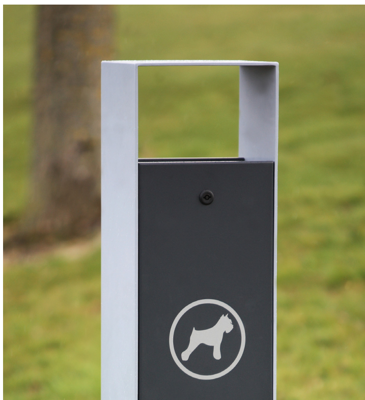
Right, s53 bin detail.

All moving parts should be kept clean and lubricated to ensure a long life. A spray lubricant such as 'WD40' is widely available and well suited.