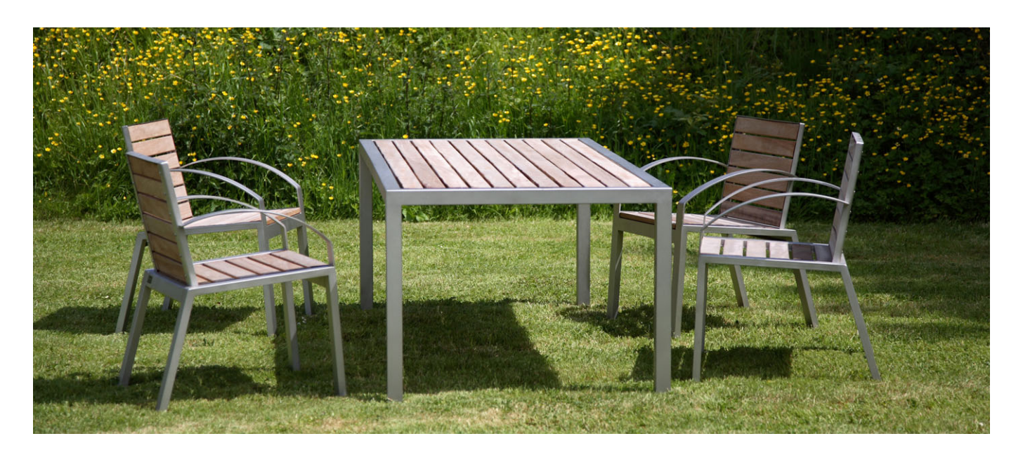
Above , s 59.2 table, L2m and s 59.2 chairs with untreated iroko timber.

If the timber is left untreated, over time it will gradually change to a silvery grey colour. The timber will remain structurally sound without further maintenance.