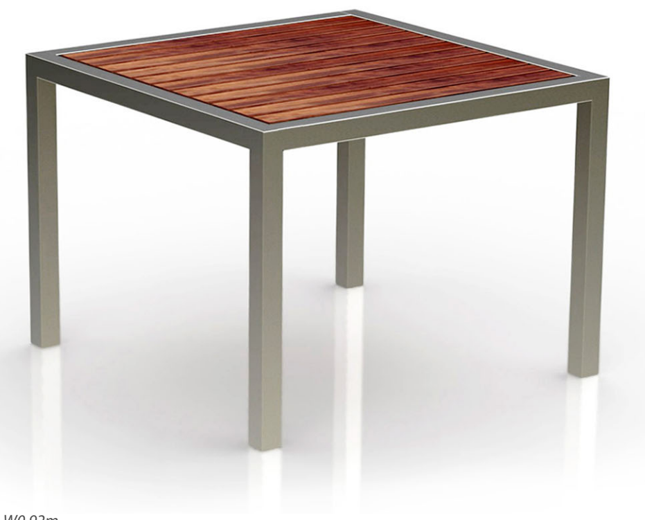
Above, s 59.2 table, L0.92m, W0.92m with micro porous stain to wood.