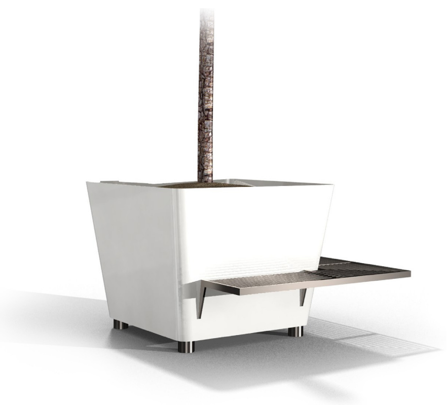
Above, t 2 tree planters in gloss red. Right, t 2 planter in bright white with stainless steel seat.