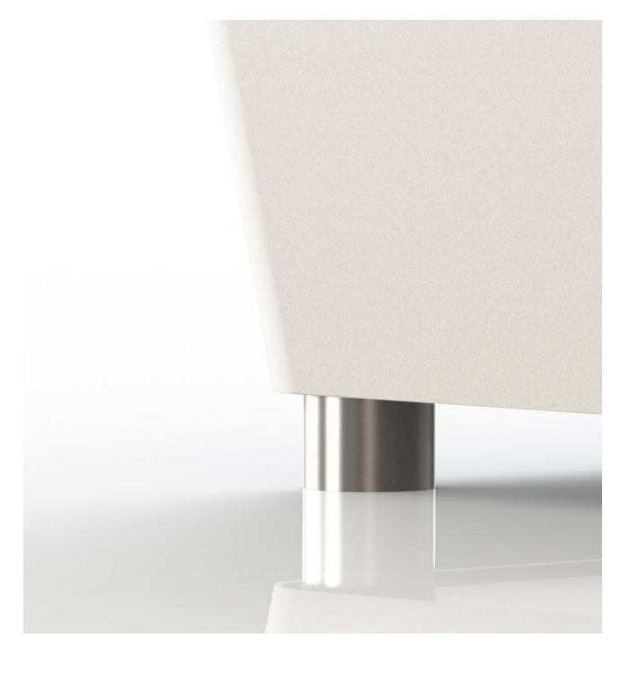
Right, t2 adjustable stainless steel foot detail.

In cases where the surface is severely stained as a result of severe environmental conditions or scratched due to misuse, it may still be possible to restore the original finish. Contact Omos for advice on such issues. There are many stainless steel polishes available to enhance the surface finish. Omos recommends 'Avesta Finishing chemicals' and can advise where to purchase.