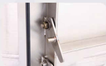
All units include a mechanical step lock for securing the step when stowed