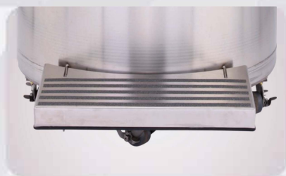
Integral folding step with slip-resistant surface