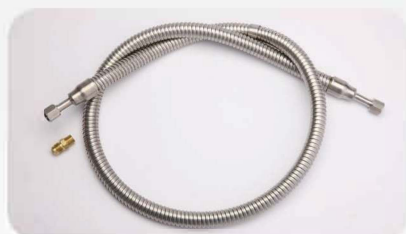
Flexible Fill Hose with 1.27 cm I.D. includes dual swivel connectors and a 3/8" male NPT adaptor included with purchase.