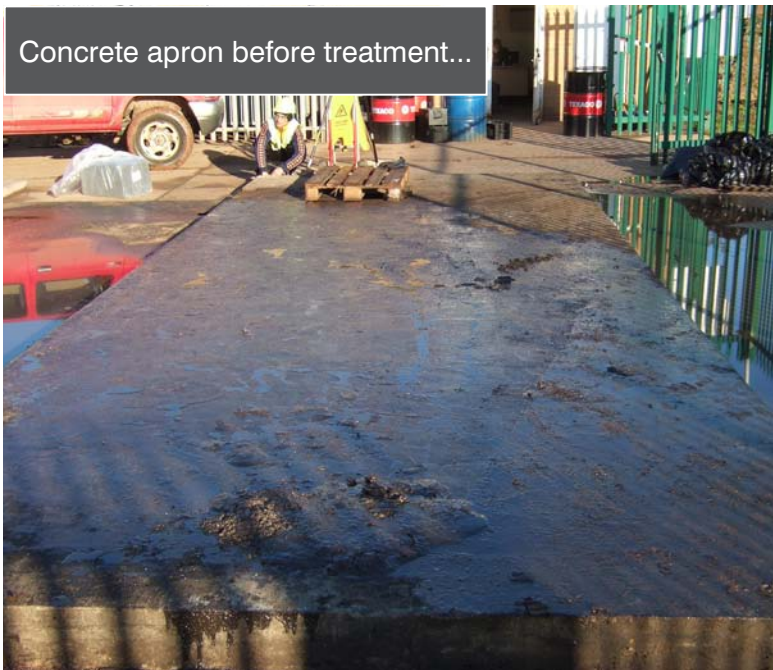
Concrete apron before treatment...