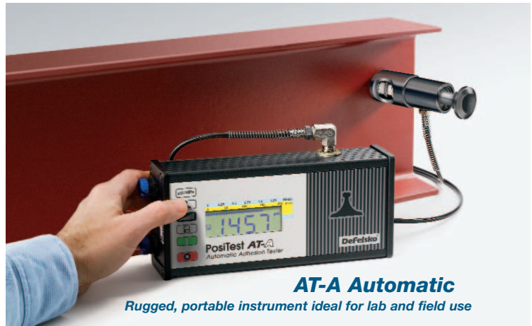
AT-A Automatic Rugged, portable instrument ideal for lab and field use