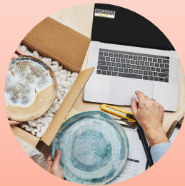
CONTRACT PACKING FOR ECOMMERCE