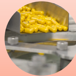
FOOD CONTRACT PACKING