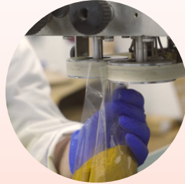
CONTRACT FILLING (POWDER, LIQUID...)