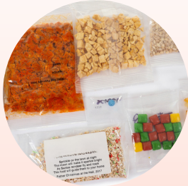
VERTICAL BAGGING (VFFS)