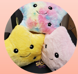
REWORK & RECTIFICATION