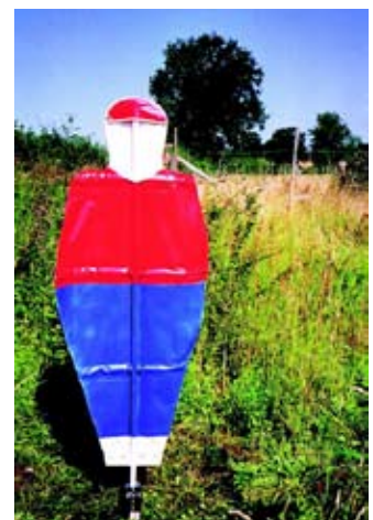
Now you do