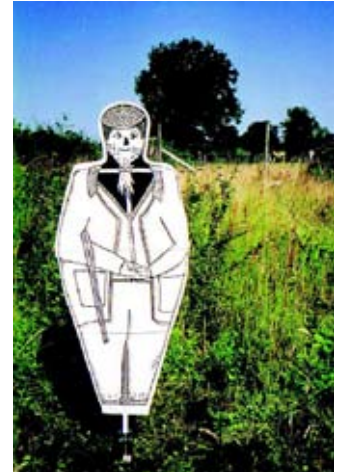
Now you see it