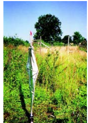
Now you don't