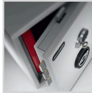
3-Way Locking Bolts