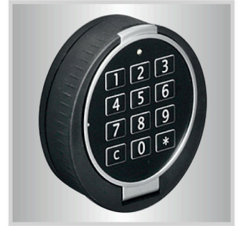
Electronic Locking Option