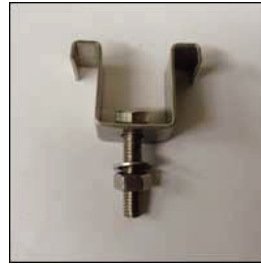
38mm M clip £1.70