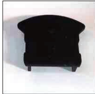
Handrail end cap £1.00