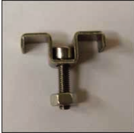
Mini-Mesh M clip £1.60