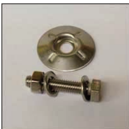
Small plate washer £1.00