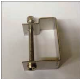
50mm G clamp £1.90