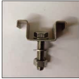
25mm M clip £1.60