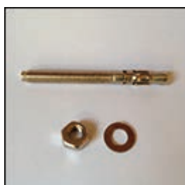
M8 x 80 anchor bolt £2.00