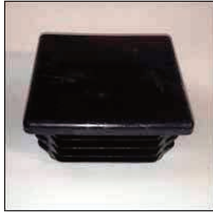
60mm box section cap £1.00