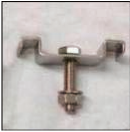
12mm M clip £1.60