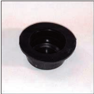
Ladder rung cap £1.00