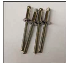
M4 x 12 rivets £20/100