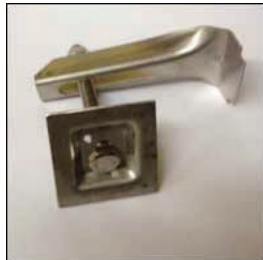
25mm J clamp £1.70