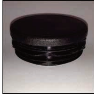
50mm round tube cap £1.00