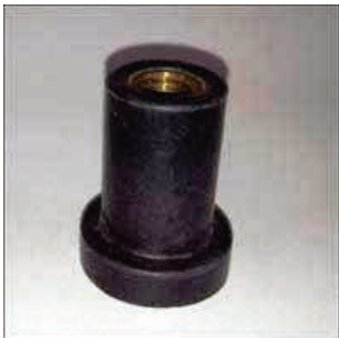
M8 rubber nutsert £1.00