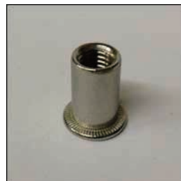
M8 Nutsert £0.50