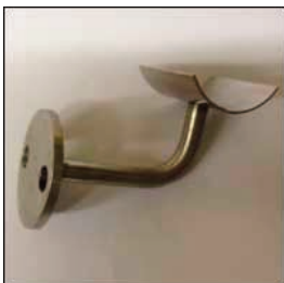
50mm tube support £3.50