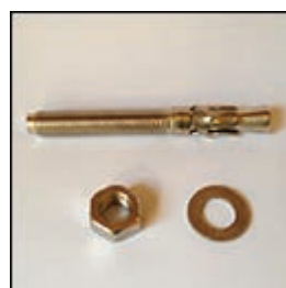
M12 x 100 anchors £2.50