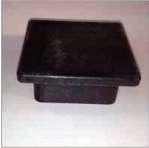
50mm box section cap £1.00

We have many different types of plastic fittings and fixings available to make your installation look professional giving it a great finishing touch. We also have access to low-cost tooling so if you need a special plastic component please contact us for details.