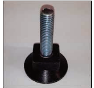
M10 adjustable foot £1.50