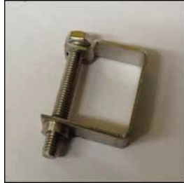
Mini G Clamp £1.60