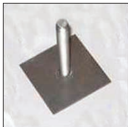
M10 adjustable foot £2.50