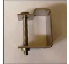
38mm G clamp £1.80