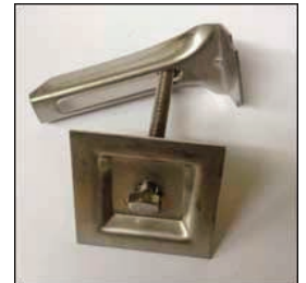
50mm J clamp £1.80