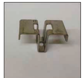
Pultruded clip £1.70