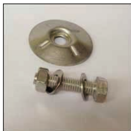
Large plate washer £1.20