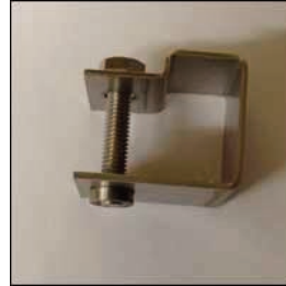
25mm G clamp £1.70