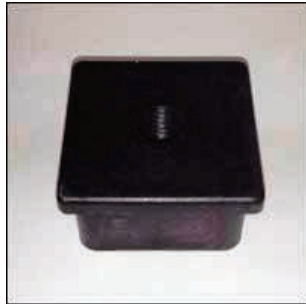
Grating insert £1.00