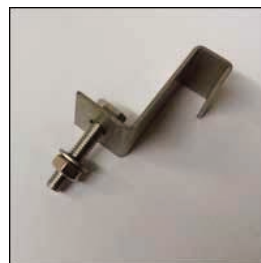
25mm L clip £1.70