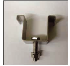
50mm M clip £1.80