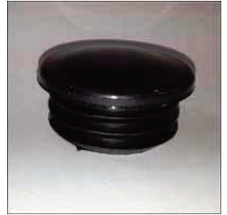
38mm round tube cap £1.00