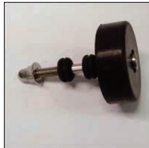
Safety gate magnet £20.00