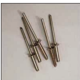
M4 x 20 rivets £20/100