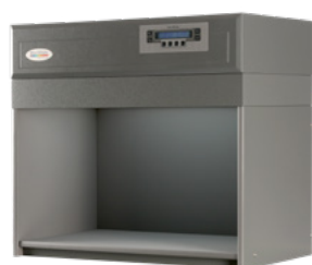
CAC60 Cabinet fitted with Diffuser