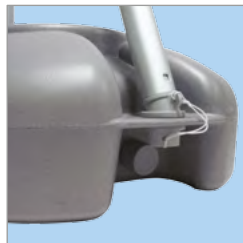
Water-fillable base with clip-in leg fixings