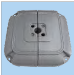
2-part base for ease of transportation