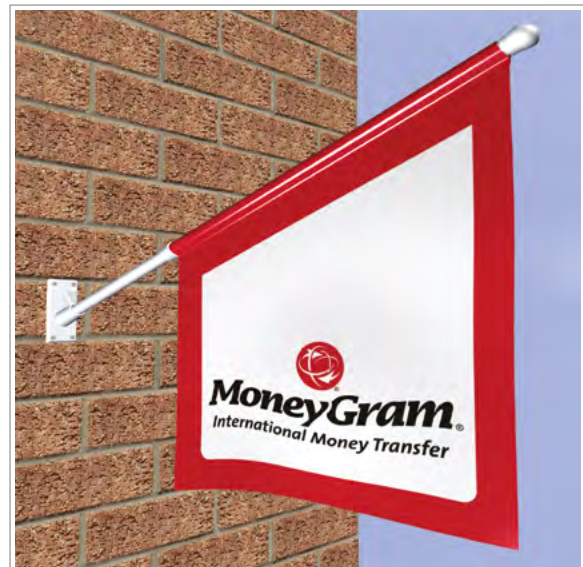
With printed Display Flag