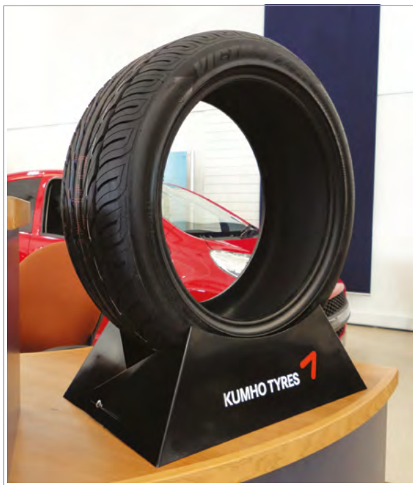
Aluminium Beartrap with gloss black finish and direct to surface branding