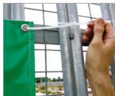
All banners supplied complete with tie-wraps