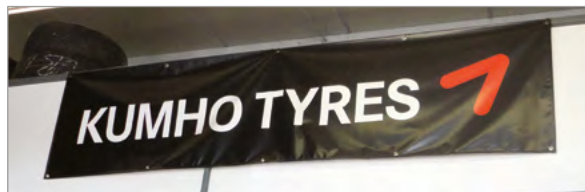
Light block PVC banner