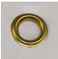
Gold finish metal eyelet