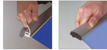
'Clamp rails' make installing and removing banners quick and easy