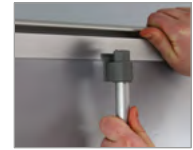
'Top-hat' pole/top rail connection