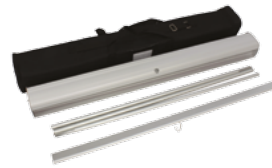
All components fold away into portable carry bag (included)

Recyclable Aluminium case, top rail, pole and folding feet