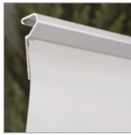
Adhesive top rail bonds to rear top edge of banner