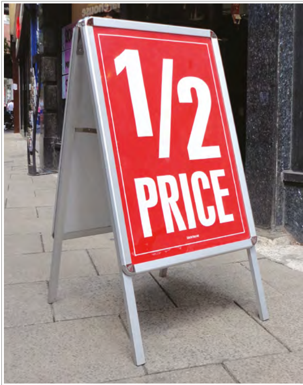
With silver anodised frame and bright chromed corner mouldings