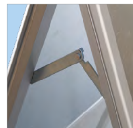
Locking side arms ensure stability