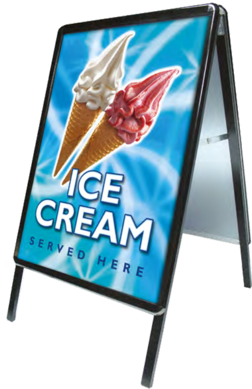
With black powder coated frame and black chromed corner mouldings