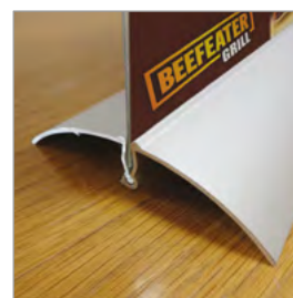
Spring-powered 'grip-action' bases