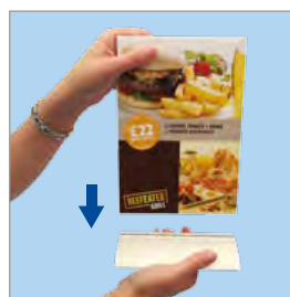
Simply grip the base open and insert the sleeve