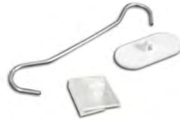
Each kit includes ceiling hooks and 2 styles of 'button' eyelets