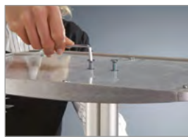
Base/leg assembly using Allen key (supplied)