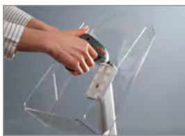
Display shelf fixes easily onto stand with screws (supplied)

Polycarbonate shelf, aluminium leg, high impact polystyrene (HIPS) base and steel base plate