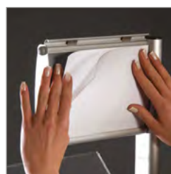
218 × 165mm header insert protected behind cover sheet