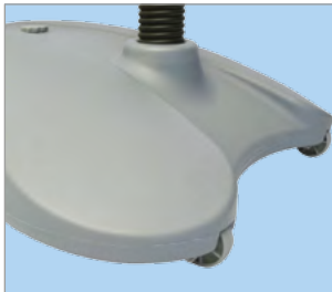
Built-in wheels for ease of movement