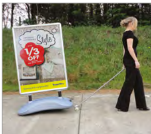
Purpose-designed trolley available separately (see page 28 for details)