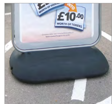
Lower cost, lighter weight base option available for 30" x 40" and A0 sizes. Volume/contract enquiries only. Call for details.