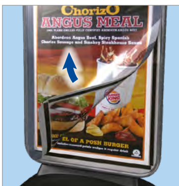
Magnetic poster covers for quick and easy poster change

Black base as standard to hide dirt and marks