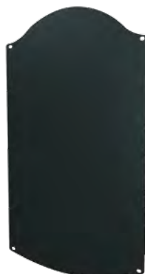
Reverse for single chalkboard display