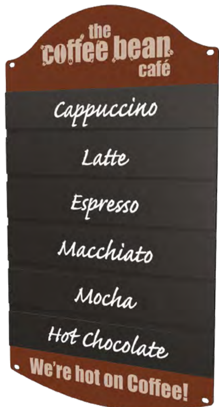
With printed header and footer