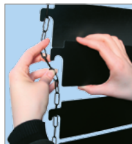
Individually reversible slats