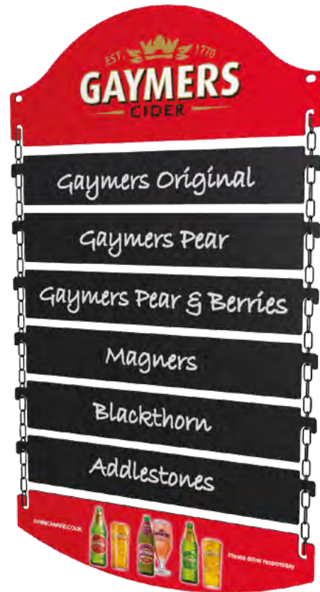
With printed header and footer panels