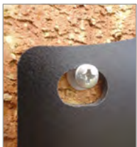
Fixing holes in header panel – ideal for wall-mounting