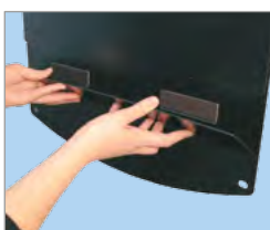
Individual magnetic slats

Made to order Minimum order quantity: 10