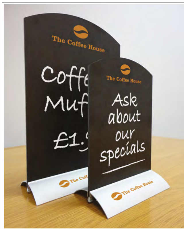
With printed panels and pad-printed bases