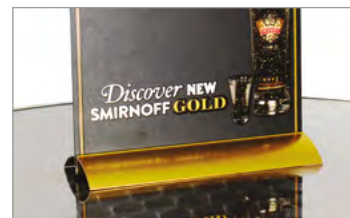
Custom base with gold finish