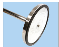
14.4kg stanchions with 360mm diameter bases for optimum stability

Recyclable Steel poles and bases. Designed for easy 'end of life' recycling.