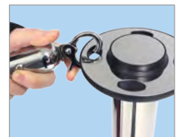
Ropes feature quick and easy 'clip-in' attachment