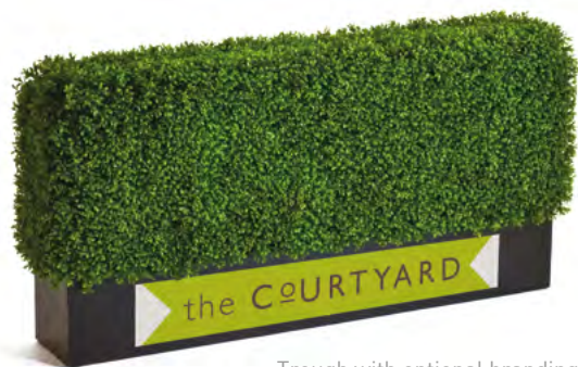
Trough with optional branding panel