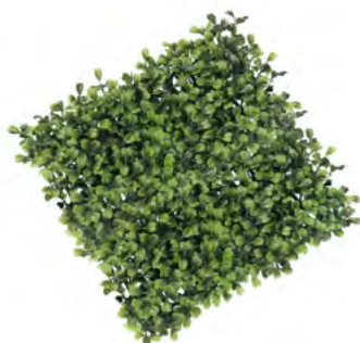
Standard boxwood foliage

Boxwood matting available separately – call for details