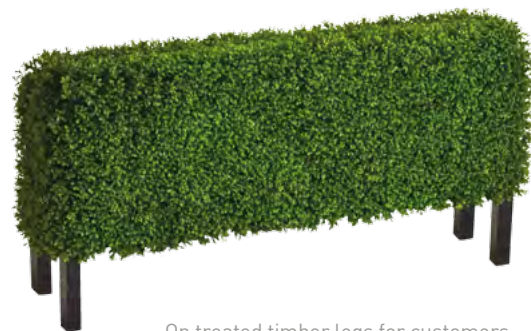
On treated timber legs for customers own trough or for soft ground installation

Boxwood matting available separately – call for details