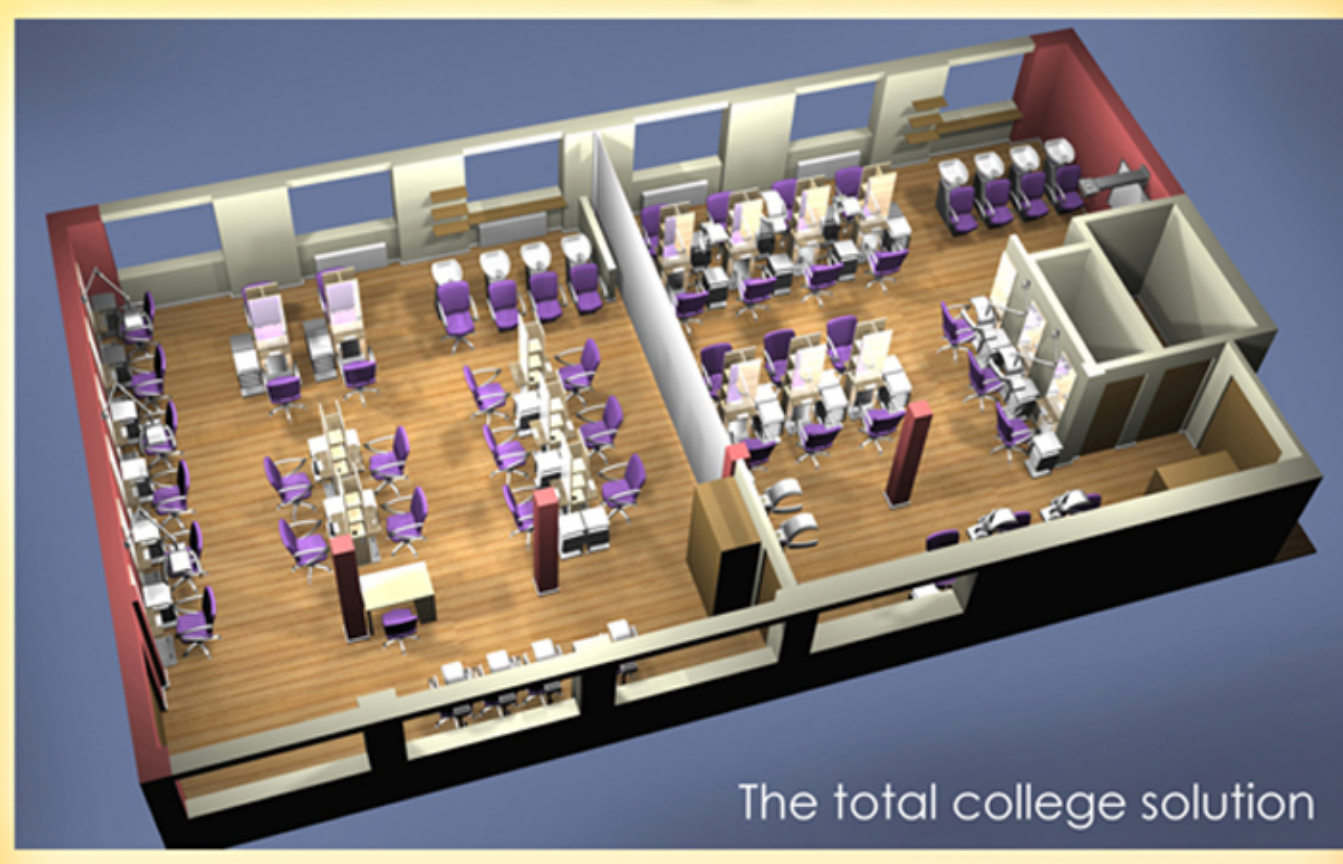
The total college solution