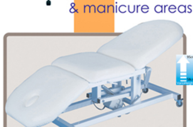
3 Section Electric

Electric couches, standard couches, therapist stools, trolleys, manicure stations, pedicure equipment, spa furniture, vanity units, cubicles, steamers, magnifying lamps and specialised equipment.