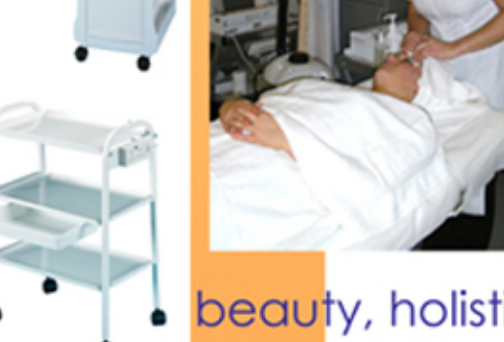
beauty, holistics & manicure areas