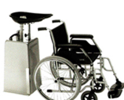
shampoo & dispensary areas