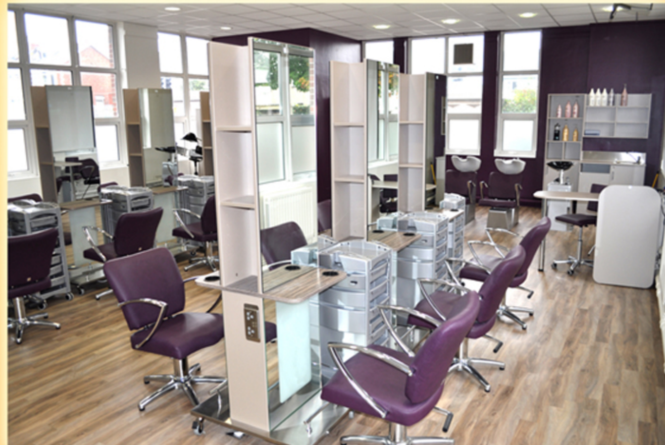
From concept to completion.