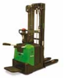
S313L - 316L - 320L