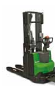
S212L - 214L