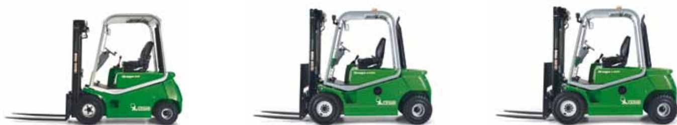
Drago 150 - 200