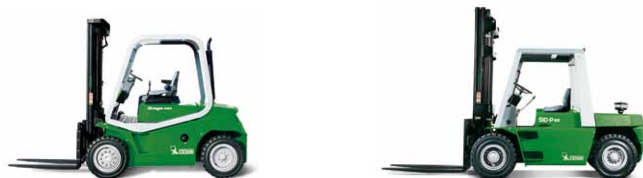
Drago 400 - 450 - 500