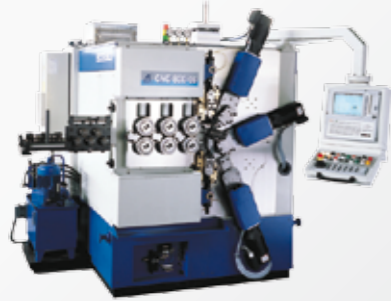
Bobbio CNC 800s