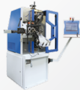
Wafios FSE 33