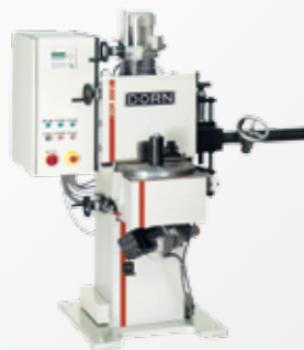
Dom DR 300